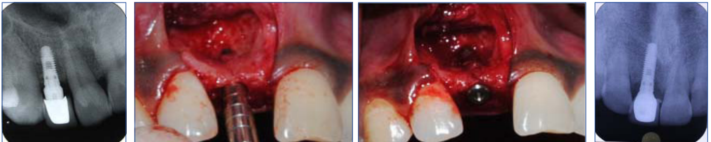
[Table/Fig-2c]: Radiograph. [Table/Fig-3a]: Osteotomy site condensation [Table/Fig-3b]: Dental implant placement. [Table/Fig-3c]: Radiograph

the surgical site and also helps to accelerate the integration and remodelling of the grafted biomaterial [3,7]. The fibrin clot plays an important mechanical role, with the PRF membrane maintaining and protecting the grafted biomaterials and PRF fragments serving as biological connectors between bone particles [8,9]. The integration of this fibrin network into the regenerative site facilitates cellular migration, particularly for endothelial cells necessary for the neo-angiogenesis [2], vascularisation, and survival of the graft. The platelet cytokines (PDGF, TGF, IGF-1) are gradually released as the fibrin matrix is resorbed, thus creating a perpetual process of healing [10]. The presence of leukocytes and cytokines in the fibrin network can play a significant role in the self regulation of inflammatory and infectious phenomenon within the grafted material [11]. The clinical application of PRF helps in the integration and remodelling of both soft tissues as well as hard tissues. A major disadvantage could be the shorter duration of action of the fibrin matrix, which is about 7-10 days which signifies the life span of the platelets.