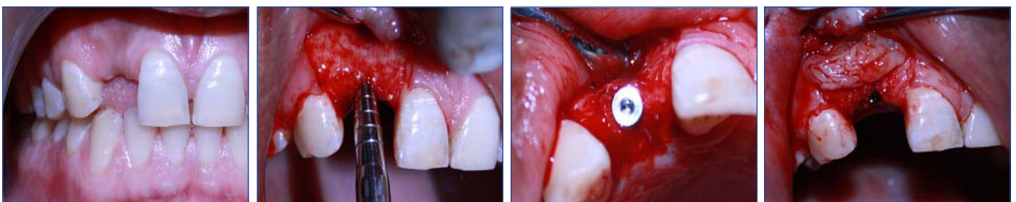
[Table/Fig-1a]: Partially edentulous ridge [Table/Fig-1b]: Condensation of prepared osteotomy [Table/Fig-1c]: Dental implant placement [Table/Fig-1d]: Platelet-rich fibrin placed over Xenograft

The technique discussed in this article have been derived from a combination of techniques suggested by Hom Lay Wang and Carl Misch [1] where their aim was augmentation of deficient alveolar ridge and correction of osseous defects around dental implants along with Tatum's expansion techniques. Elimination of the drilling sequence prevents excessive bone loss and wash out of growth factors which helps in regeneration. Abstaining from drilling also prevents heat generation thereby avoiding bone necrosis and also aid in decreasing the healing duration of the site. PRF is a matrix of autologous fibrin in which are embedded a large quantity of platelet and leukocyte cytokines during centrifugation [2,3]. The presence of cytokines within the fibrin mesh allows for their progressive release over time period of 7-11 days which is the life span of platelet following which the network of fibrin disintegrates [4]. The PRF membrane acts like a fibrin bandage [5], which significantly serves as a matrix to accelerate the healing of the wound edges and surfaces [6]. The PRF provides post-operative protection to